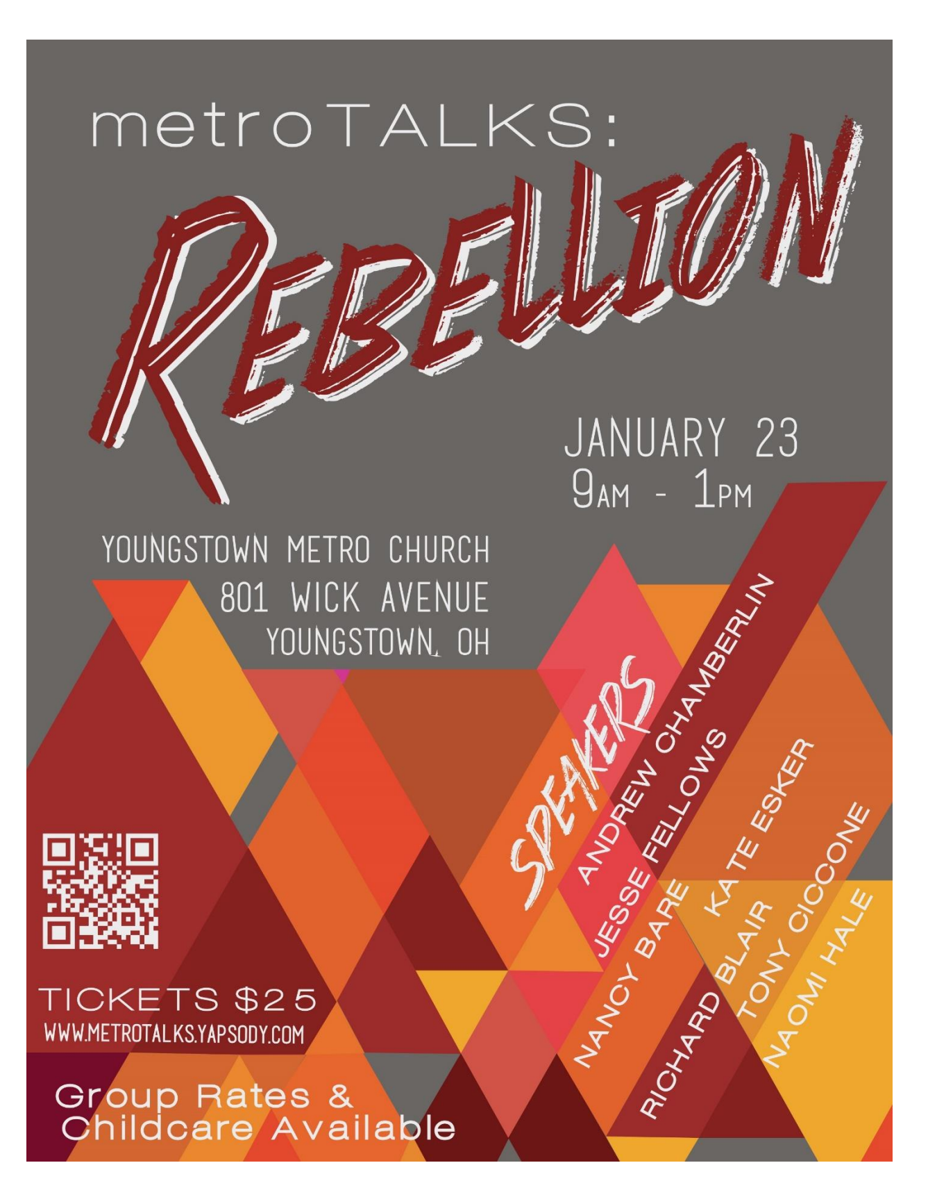
Reach People! - Make Disciples! Go into all the world and make Disciples! (Matthew 28:19)